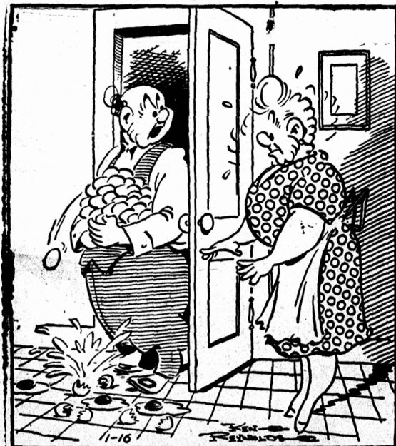
"The basement is no place for that chicken we got with a Guardian Want Ad—she's started laying!"