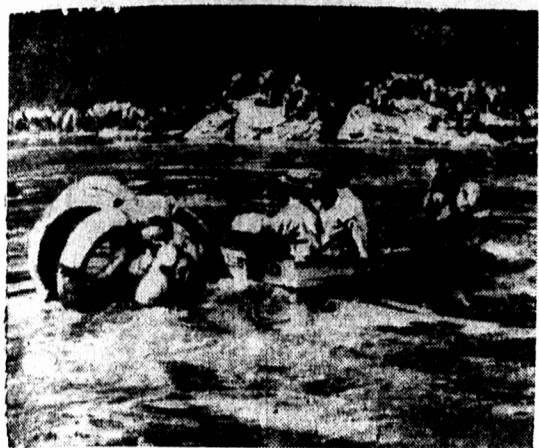
Rescue workers at Niagara Falls tow "The Thing," so nicknamed by the inventor Red Hill, from a point below the Falls. "The Thing" carried its maker to his death when he attempted to go over the 165-foot high Horseshoe Falls as an estimated 350,000 looked on.