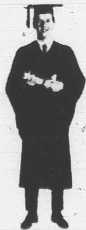
and a sixth year?