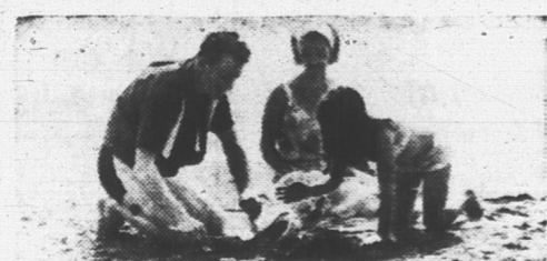
and a fifth year...