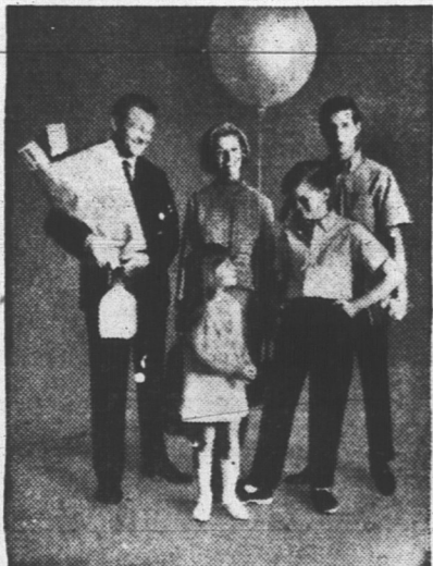
and a second year...