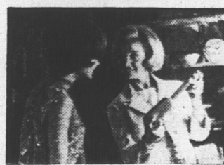
and a fourth year...