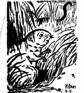
It was the tail of Black Pussy the Cat.

There was one thing that those two mice didn't think about. There is always something that folks do not think about. They completely forget that at this time of year there was nothing to be afraid of from Mr. Blacksnake or any other members of the Snake family. Somewhere in his secret retreat, probably down deep in the ground or among the rocks, Mr. Blacksnake was fast asleep. It wasn't warm enough to wake him up. If Danny had remembered this, they would have known they had nothing to be afraid of from Mr. Blacksnake.