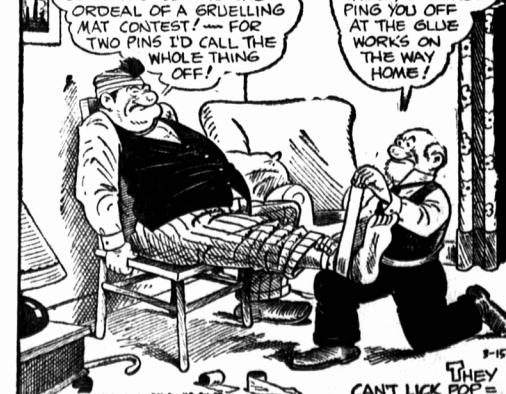
CANT LICK POP