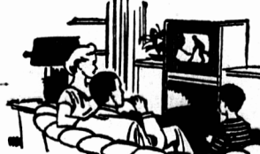
Television brings far-away events to your eyes. Most metal parts of the tubes of the television camera and the receiving set are nickel or nickel alloys.