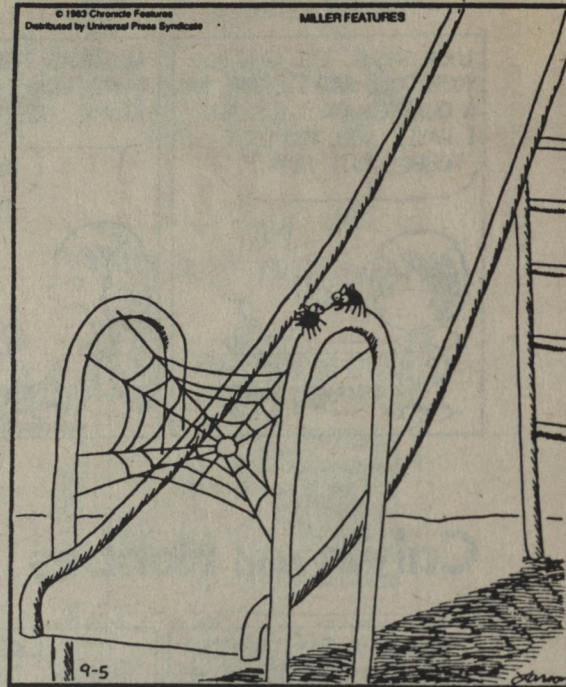
"If we pull this off, we'll eat like kings."