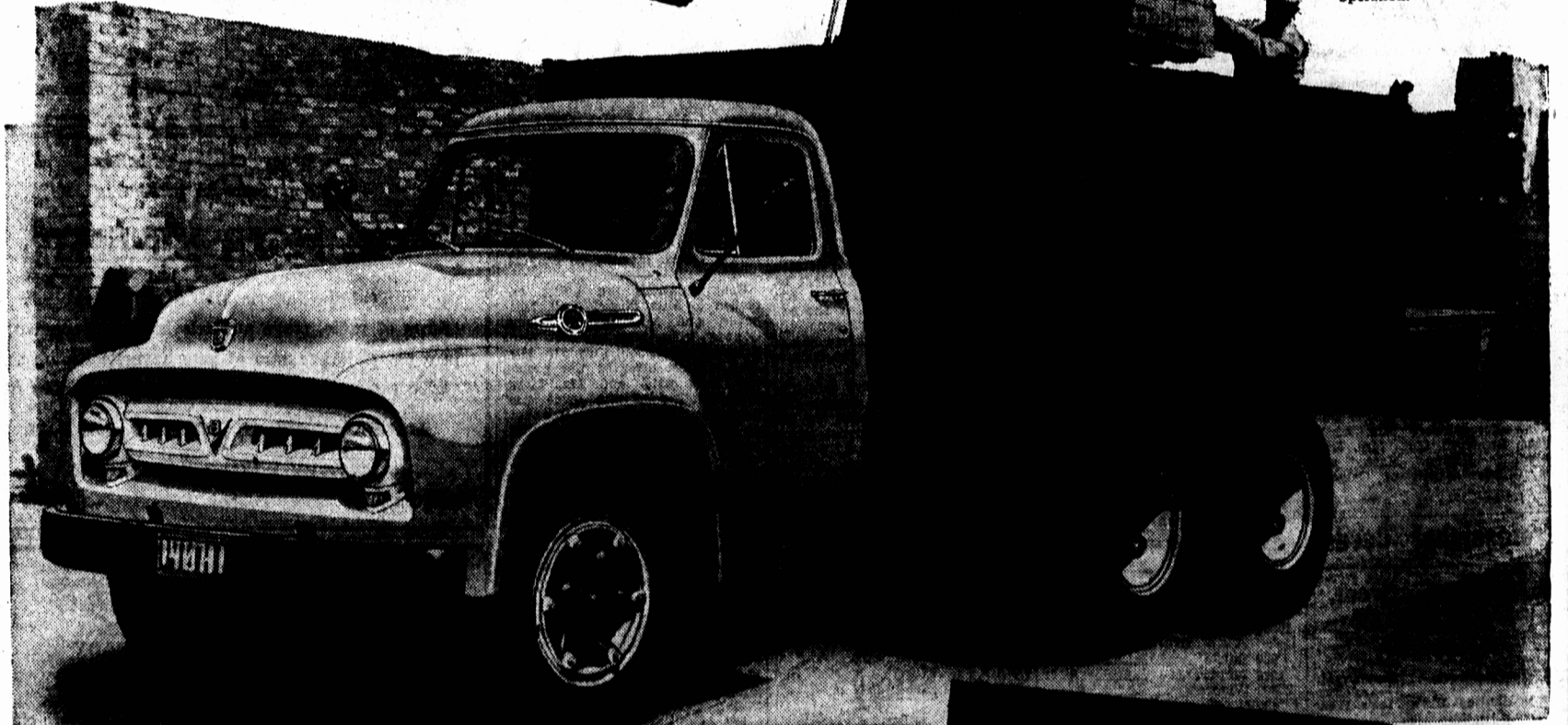
F-800 "BIG JOB" — a mighty giant of the Ford Truck line... G.V.W. ratings to 23,000 lbs... G.C.W. ratings to 48,000 lbs... takes bodies from 7 1/2 to 19 feet... combines big power and big strength with big economy of operation.