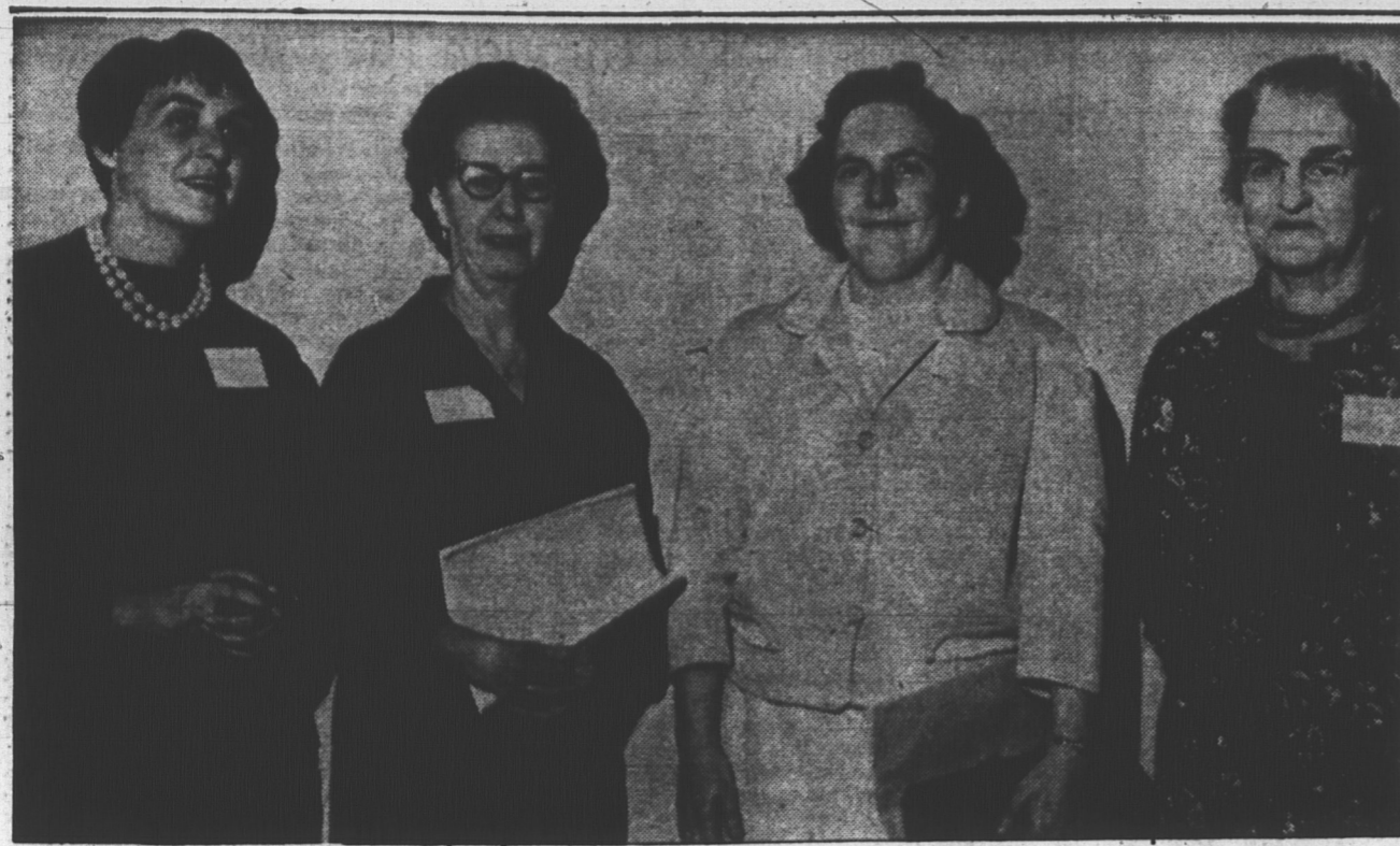
FOUR HOSPITALS on the island were represented at Wednesday's 45th annual meeting of the association of nurses for Prince Edward Island held at Summerside.