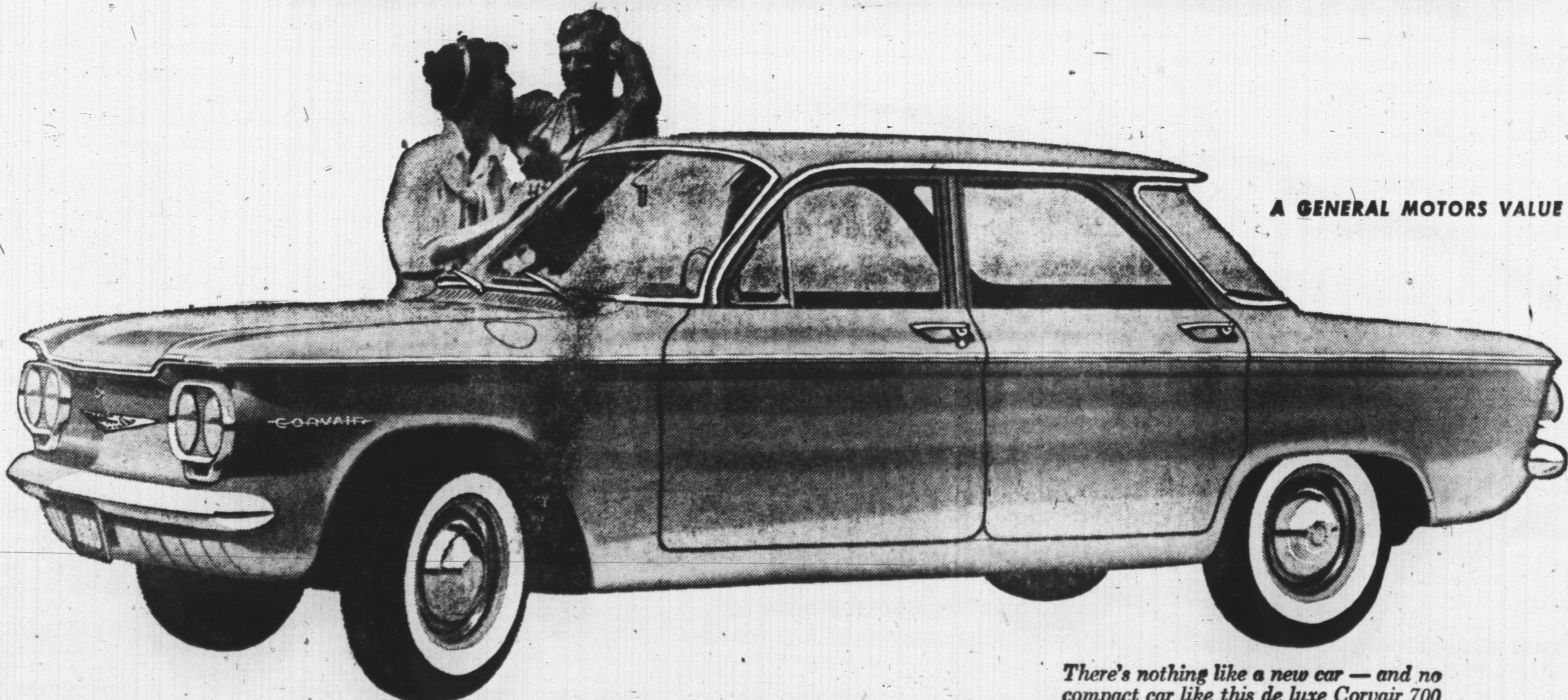
A GENERAL MOTORS VALUE

Here's the car created to conquer a whole new field... General Motors revolutionary compact Corvair. One glance at the Corvair and you'll agree... here is a totally new way of going, and going in luxury! From its trunk-in-the-front to the radically new Turbo-Air rear engine, Corvair is truly new. And it's newness with a purpose... newness designed to bring you the riding comfort and six-passenger luxury standards that Canadians look for, together with true compact-car handling and economy. Just ten minutes at the wheel will put the proof in your own hands. You've never known such a breath-taking blend of luxury and practicality. See, drive and delight in the revolutionary new Corvair at your Chevrolet dealer's.