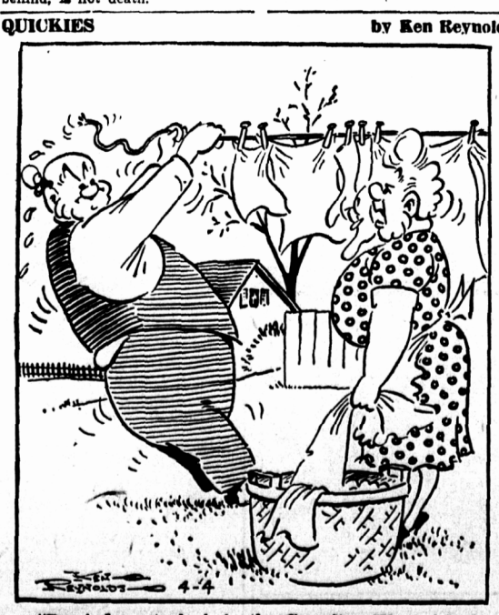
"Remind me to look in the Guardian Want Ads for a new clothesline post!"