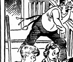
OKAY, MISTAH MAJOR! ONLY I CAN'T HELP MUCH STROPPIN' HIM ON EDGE! AN' BRANCH ON ATHLETICS IS THE 100-YARD DASH — WHEN A BRAWL SURROUNDS ME, I FORGITS MY MUGGLES AN' FEETS FOR SAFETY!