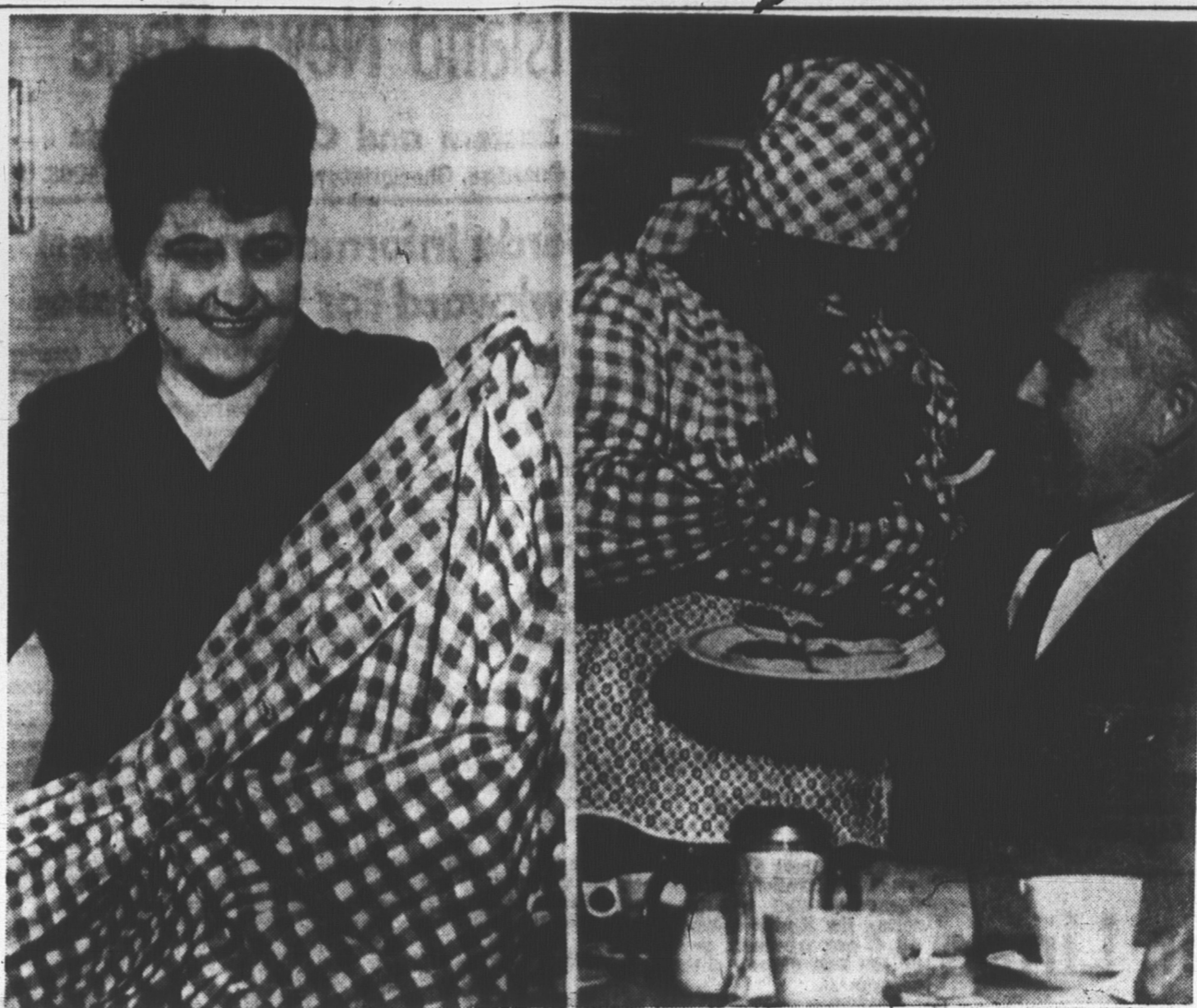
SHE FILLED THE BILL