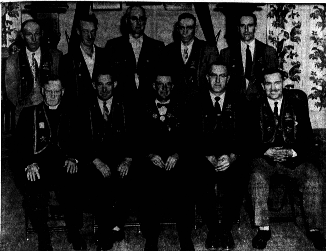
NEW OFFICERS OF GRAND ORANGE LODGE