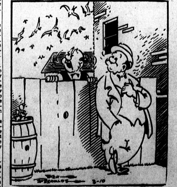
"I'm selling my rowboat with a Guardian Want Ad—attracts too many gulls!"