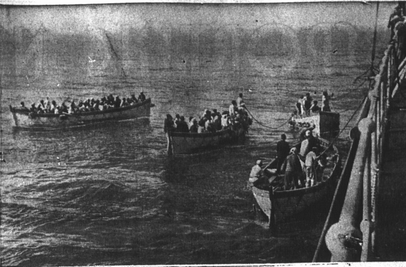
Packed so full of humanity that children had to be tucked under the seats, these lifeboats were picked up by the oil tanker, Associated, which answered SOS about 4000 miles west of San Francisco. The lifeboats contained 209 Japanese and 2000 pas Maru which burned, exploded and sank in the Pacific en route to Yokohama.