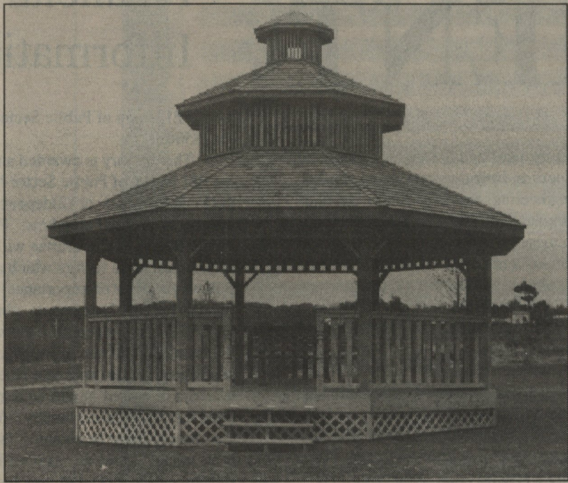
Our fantabulous gazebo thingy