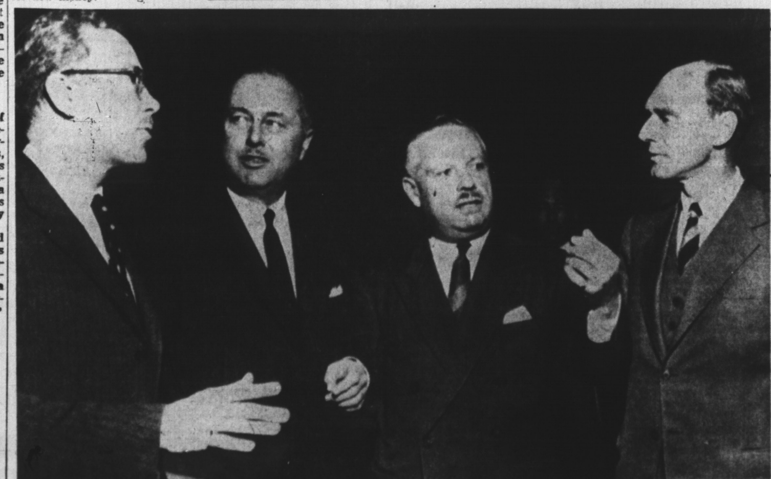
FINANCE MINISTER Fleming, second from right, gestures toward Premier R.L. Stanfield of Nova Scotia as they chat at Ottawa about financing at the Dominion-Provincial conference. The conference closed yesterday.