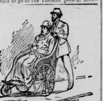
Portrait of a man, likely the subject of the medical case.

One of the Most Remarkable Cases on Record—Ten years of intense suffering from Acute Rheumatism.