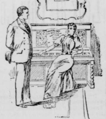
Illustration of a man and a woman in a room, likely the characters from the story.

Miss Nora Foster was sitting on the floor of her cabin, which was littered with boxes, baskets and gazing parcels.