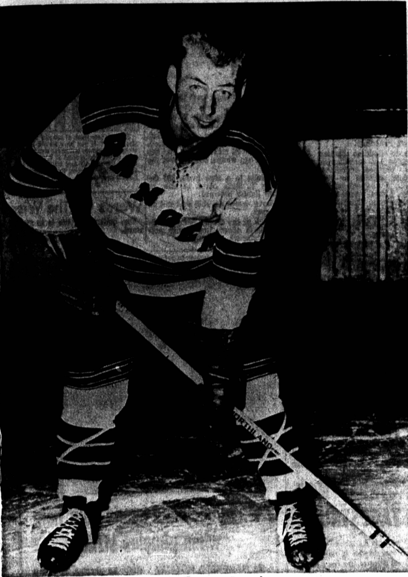
Top Ranger Rookie