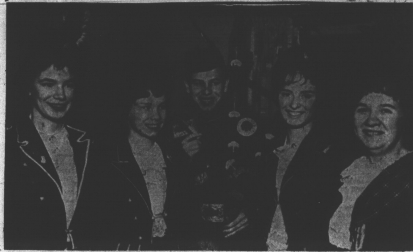
THE SKIRL OF BAGPIPES and the swirl of the multi-colored kilts of Scottish dancers will be evident at the Prince of Wales College this evening. Sixty-two performers, including Nova Scotia, New

Brunswick and Prince Edward Island talent, will all be part of the mammoth Scottish concert and highland revue. Among attractions will be the Lovat Scots Dancers, a provincial group, the Lovat Scots Pipe