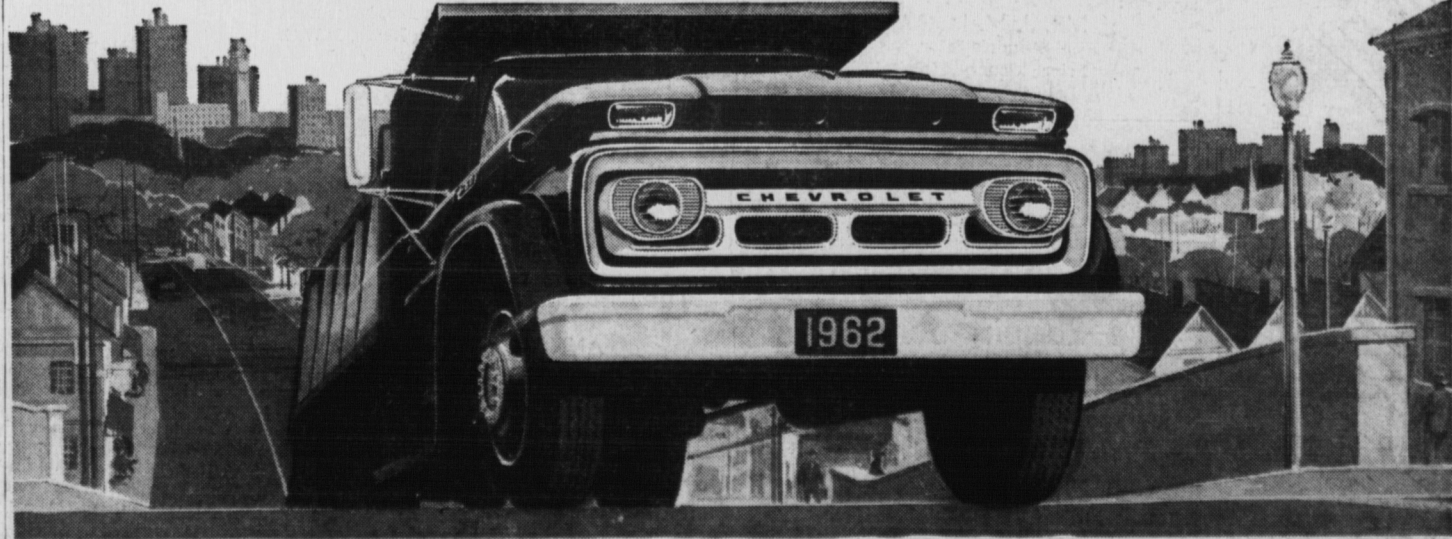
A GENERAL MOTORS VALUE

save money in the long run... and the short run, too!