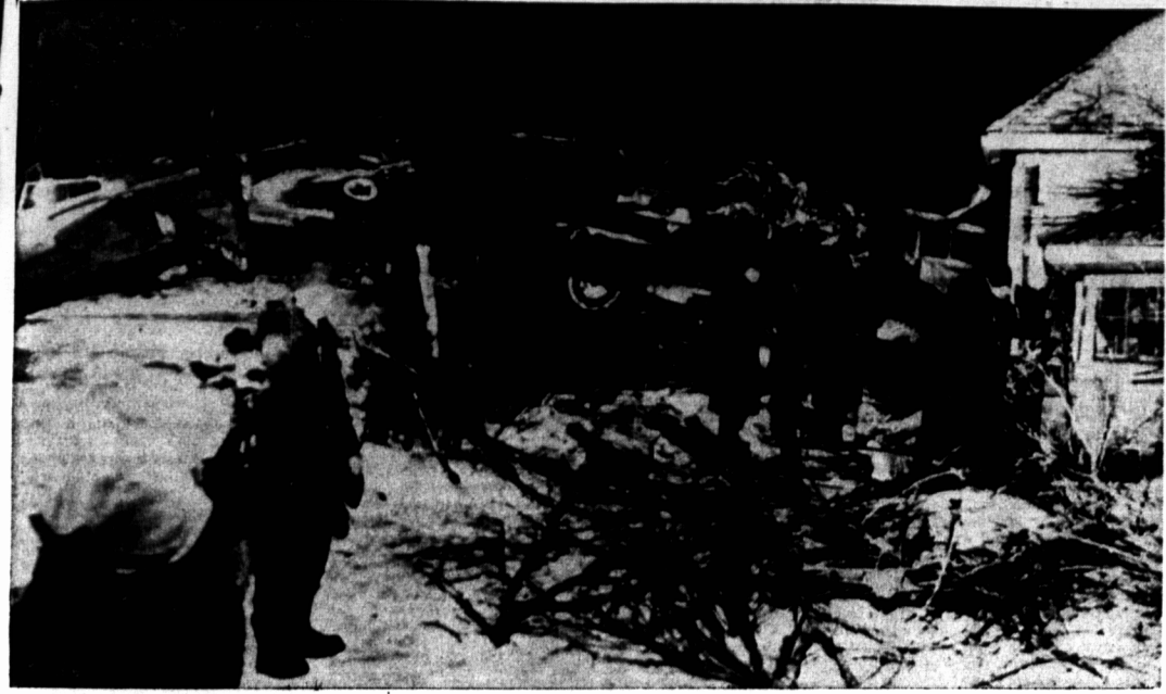
PLANE CRASHES HOUSE

Six crew members escaped severe injuries when this RCAF Mitchell bomber crashed into a house in a residential section of Stevenson field. The plane damaged three houses before coming to a stop on the first floor of an unoccupied house. Occupants of a bungalow where the plane's nose finally stopped were away.