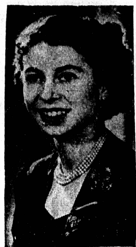
POURTRAIT OF A PRINCESS

Until tomorrow — Diary — Good-night . . . . .