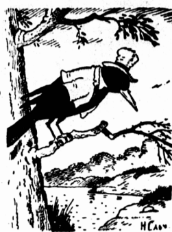
Then he lighted on a tree where he could see that clam.

So it is that as Blacky flies over the Green Forest and the Green Meadows, those bright eyes of his miss very little down below. When he sees something unfamiliar, or something familiar that is out of place, he doesn't pass on until he has learned all he can about it. It isn't just curiosity, although he has plenty of that. He is too