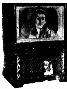
Brilliant, crystal-clear Television is received now from the Moncton station.

We are now adequately equipped to install and service, under expert supervision, all the Television Sets we sell. A follow-through of Holman's Policy of being able to provide on the spot Service-After Sales.