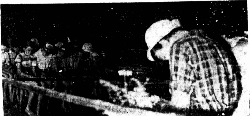
"A morning worship in the camp chapel."