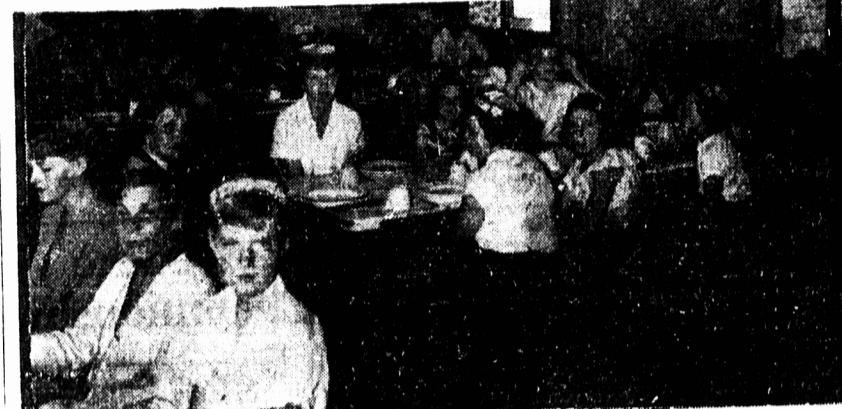
"Hungry campers sit for the afternoon meal."