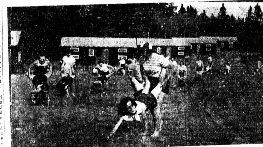
"Some free time activities on the camp grounds."