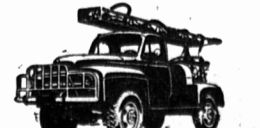
PLUS four-wheel drive models of 11,000 and 15,000 lbs. GVW—built for lowest cost operation in roughest, toughest terrain.