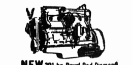
NEW 201 by Royal Red Diamond 501 engine standard in R220 and RF230 series models.