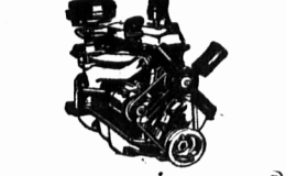
NEW increased power now available in all International truck engines.