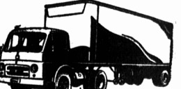
NEW Cab-over-engine models—3 series. 15' models from 11,000 to 30,000 lbs. GVW—50,000 to 65,000 lbs. GCW.