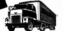
PLUS 10 diesel engines for 30 models. The INTERNATIONAL line of 185 basic models offers widest choice of power—30 engine gasoline, LPG and diesel.