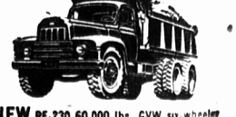
NEW RF-230 60,000 lbs. GVW six-wheeler added to line of 24 six-wheeler models. International six-wheeler offer everything you need in a "tough job" heavy-duty truck.