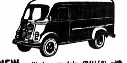
NEW multi-stop models (RM150) with METRO bodies—14,000 to 16,000 lbs. GVW. Ten Metro and Metrolite Models. METRO-Matic transmission available.