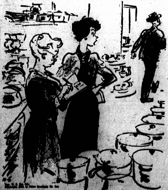
"I didn't expect to meet any single men in kitchenware or I'd have had my hair done."