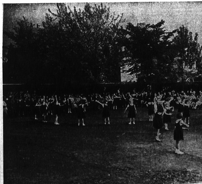
Play gymnastics are demonstrated by pupils of Grade I during a physical education showing at Rochford Square School this week. It was the first such public display of teaching school children various movements involved in a physical education program.