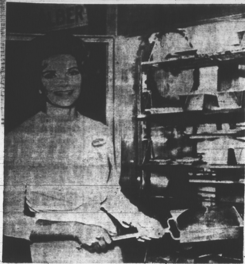
FRESH BAKED BREAD

presupposes, a rebuff to aggression and support for peoples fighting against alien domination. In practical terms this definition of established Soviet policy is taken here to mean the Soviet Union would like to support North Viet Nam to the extent necessary to produce Communist victory in Southeast Asia but limit its support to such actions as would not bring on large-scale war between the Communist powers and the U.S. By contrast the Chinese Communists talk in much more risky terms than the Soviet Union. "But they justify their advocacy of all-out support for North Viet Nam on the grounds that the U.S. is a paper tiger and will not itself take serious risk of a major Asian war." In the contest between Moscow and Peking over which is more devoted to the spread of communism, the Russians are likely to be out-bid by the Chinese, who have fewer world responsibilities. Moscow's experience in the confrontation over Cuba in 1962 could have made a critical difference in this respect. Authorities here believe the Russians in present circumstances would like to find a peaceful solution in Viet Nam on terms more nearly acceptable to the U.S. than would China which possibly would be glad to keep the Vietnamese conflict raging for years.