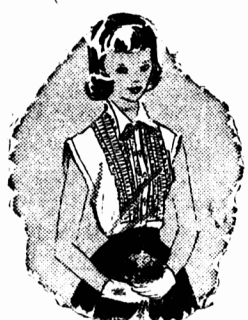
Blouses Sizes 2 to 14x