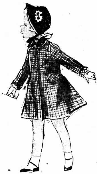
Children's Coats Sizes 2 to 6x