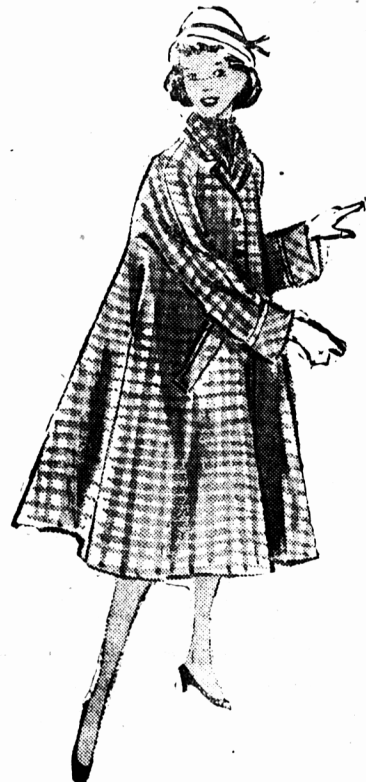
Girls' Coats Sizes 7 to 14x

Our buyer went all out when she purchased this collection of Children's Easter Togs. Fashionable tots and teens will be proud as punch in our fabulous new Easter Fashions. Come in today and see the dazzling array of Spring Coats and Coat Sets — Dresses — Skirts and Blouses.