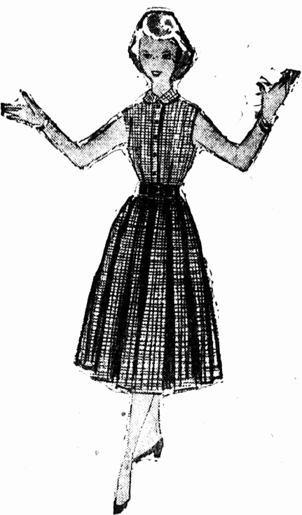
Beautiful Spring Dresses

Cottons Lawns — Nylons and crepes in colors white — red — aqua, pink, blue and yellow — very smart styles. Priced from—