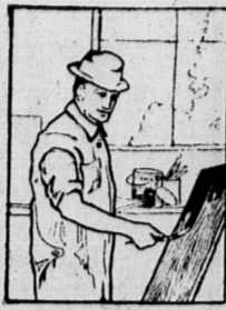
TAKE A SMOOTH, CLOSE-GRAINED PIECE OF WOOD AND PAINT IT WITH GLIDDEN ENDURANCE PAINT. USE ONLY A LITTLE ON YOUR BRUSH AND NOTICE ITS EXTRA-ORDINARY COVERING QUALITIES. GLIDDEN ENDURANCE PAINT IS ECONOMIC IN USE.