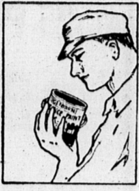
SMELL THE PURE LINSEED OIL IN GLIDDEN ENDURANCE PAINT. IT IS THIS OIL THAT GIVES IT ITS WEATHER RESISTING QUALITIES. NO INFERIOR OILS ARE USED IN GLIDDEN ENDURANCE PAINT—IT IS PURE PAINT.