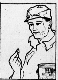
FEEL THE SMOOTHNESS OF GLIDDEN ENDURANCE PAINT. RUB A LITTLE BETWEEN YOUR THUMB AND FINGER. NOTICE THERE IS NO SUGGESTION OF ROUGHNESS OR GRIT-TINESS. GLIDDEN ENDURANCE PAINT IS CAREFULLY PREPARED AND FREE FROM ALL ALKALIS.