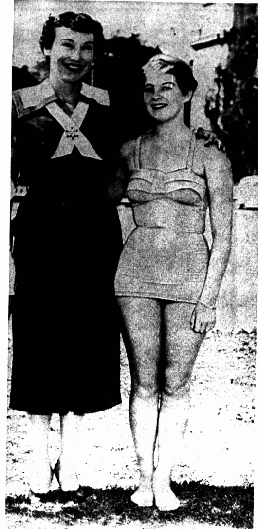
Pictured above (left) Miss Florence Chadwick, 30, of San Diego, Calif., who failed in an attempt yesterday to swim across Lake Ontario and right Miss Marilyn Bell, 16, of Toronto who accomplished the feat.