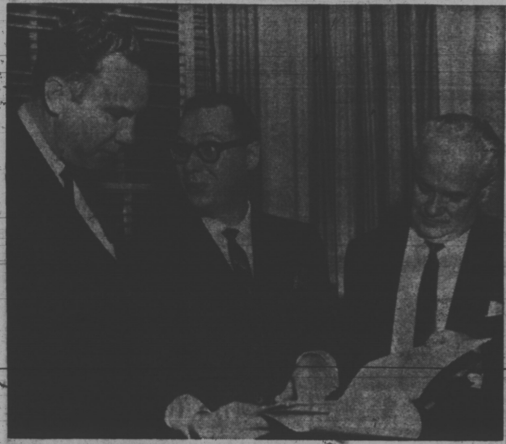
DISCUSS PAVILION AT EXPO