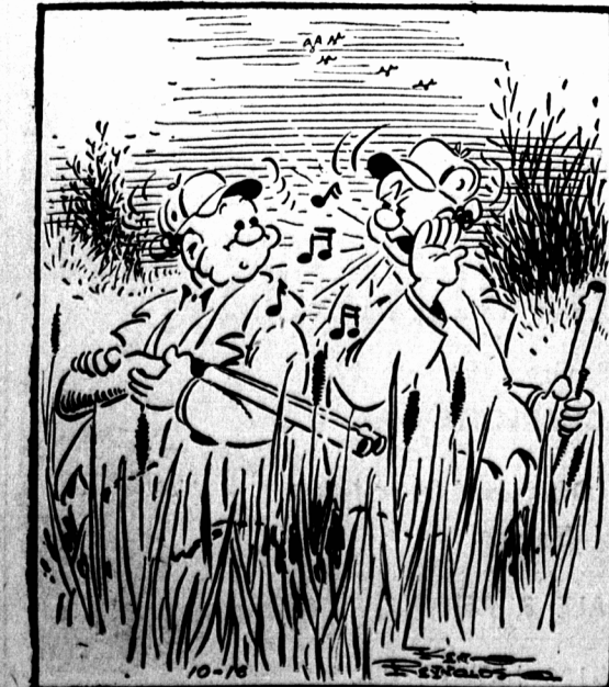
"Be careful where you shoot—I swallowed that duck call I got in the Guardian Want Ads!"