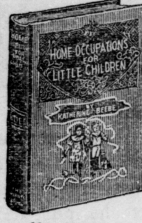
16mo, 144 pages; bound in linen, gilt top.