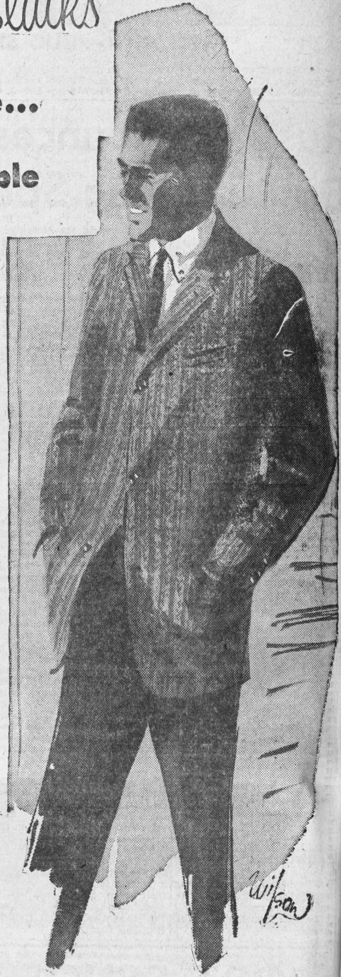
HOLMAN'S MEN'S WEAR . . . both stores