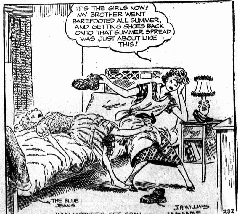
THE BLUE JEANS WHY MOTHERS GET GRAY