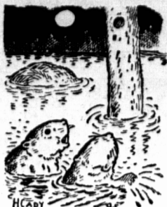
"Did you see something?" asked Mrs. Paddy.

tract when South suggested it. East won the opening spade lead with the king and continued with the ace. South ruffed and drew three rounds of trumps. When the hearts failed to divide 3-3 declarer tried to run the club suit. East ruffed the fourth round and South also lost two diamonds to go down one. South's method of play might have succeeded, of course. The hearts could have broken 3-3, as South hoped. But it strikes us as he was putting all his eggs in one basket, and not too sturdy a one at that. Suits break 3-3 only about a third of the time. The 4-2 break occurs about half the time. There was a line of play to make the hand which would succeed whether the heart division was 3-3 or 4-2. True, the winning play is hard to see and somewhat unusual. But this does not lessen the validity of a play which is demonstrably correct. After ruffing the second spade lead with the deuce South's next play should be the four of hearts. This lead has an overpowering effect. It clears one round of trumps without losing control of the suit, while at the same time it permits dummy's remaining trump to take charge of a spade return. It does not matter which opponent wins the trick or what is returned. Declarer will win four hearts, five clubs and a diamond.