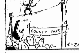
PAGE SIX THE GUARDIAN, CHARLOTTETOWN APRIL 20, 1953