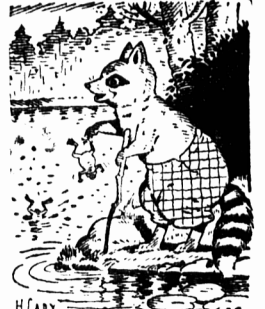
Bobby Coon hunted frogs along the shore.

It wasn't long before all the people of the Green Forest knew about that pond. In the spring Honker the Goose and his flock rested there on their way to their northern nesting grounds. On their return journey in the fall they rested there again. Some of the