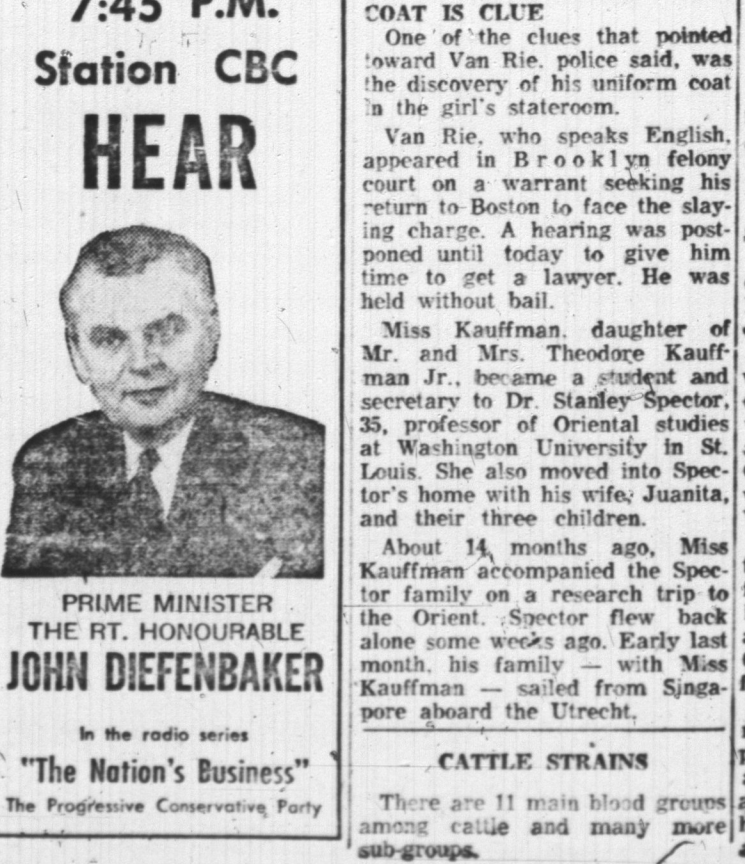
PRIME MINISTER THE RT. HONOURABLE JOHN DIEFENBAKER