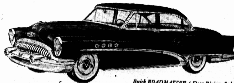
Buick ROADMASTER 4-Door Riviera Sedan

So come in and see for yourself that these are, in simple truth, Buick's greatest cars in 50 great years!