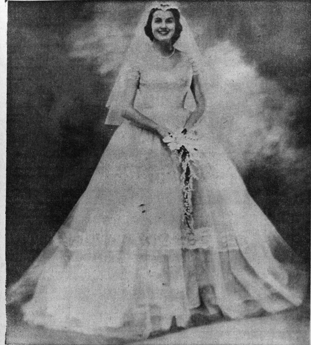
A LOVELY JUNE BRIDE