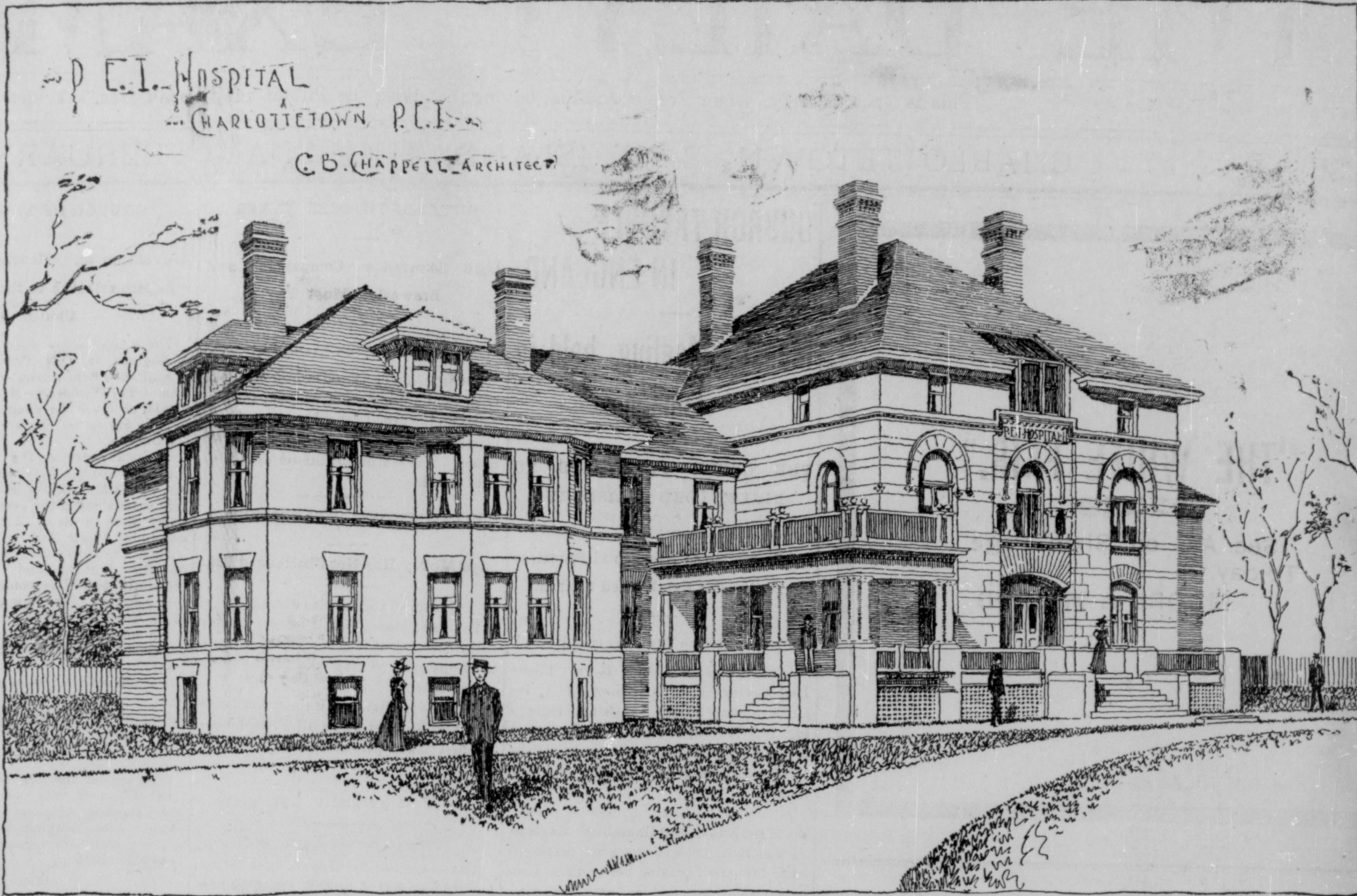
NEW PRINCE EDWARD ISLAND HOSPITAL—PERSPECTIVE VIEW.

The new Prince Edward Island Hospital, a perspective view and floor plans of which we publish to-day, is located at the east end of the city on a beautiful site containing several acres of land donated to the institution by the Rev. Ralph Brecken. The walls of the building, which are of brick, are carried up to about 6 feet above the ground and the timber of the first floor laid on. The structure, as can be seen by the cuts, will consist of a main building three stories high, and a wing containing main wards, etc., two stories and attic. The length over all is 125 feet, and the width at the widest part is 59 feet. The principal entrance will be in the main building through a hail 13 feet wide, intersecting a corridor 9 feet wide running at right angles and leading to