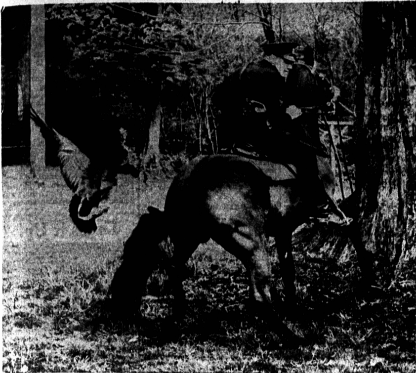
Size makes no difference when it comes to defence. When Constable Cliff Cooper, parolling Vancouver's Stanley Park on "Trooper," came too close to a gander's mate and nest, the father rushed to the defence, hissing loudly and buffeting both horse and rider with its broad, strong wings. The geese, of the big Canada goose variety, had made their homes on top of a tree stump. (CP Photo).