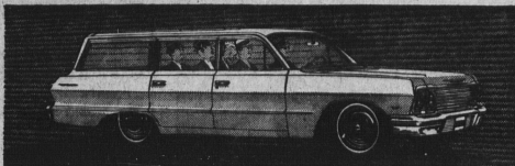
Chevrolet Bel Air Station Wagon