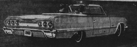
Chevrolet Impala Sport Sedan