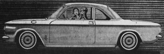
Corvair Monza Club Coupe

Chevy II made a name for itself in just one year. And this year it's even better, for the '63 Chevy II combines the easy-care features of the big Chevrolet (such as self-adjusting brakes, and 60 day/6,000 mile oil change) plus its own advantages—park-anywhere size, full-family room, pep and economy from the 4- or 6-cylinder engines and a full complement of optional power assists. Take a fresh look at the kind of car you need. Then take a good look at the new Chevy II—it's exciting!