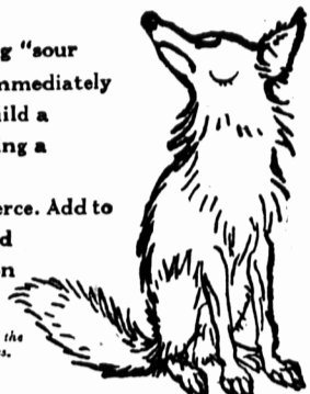
Illustration by Arthur Rackham, from the Heinemann Edition of Aesop's Fables.

MORAL: Instead of saying "sour grapes" when you can't immediately attain your ambitions, build a ladder to success by opening a savings account with The Canadian Bank of Commerce. Add to your balance regularly and you'll soon be in a position to get what you seek.