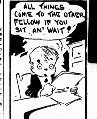
ALL THINGS COME TO THE OTHER FELLOW IF YOU SIT AN' WAIT