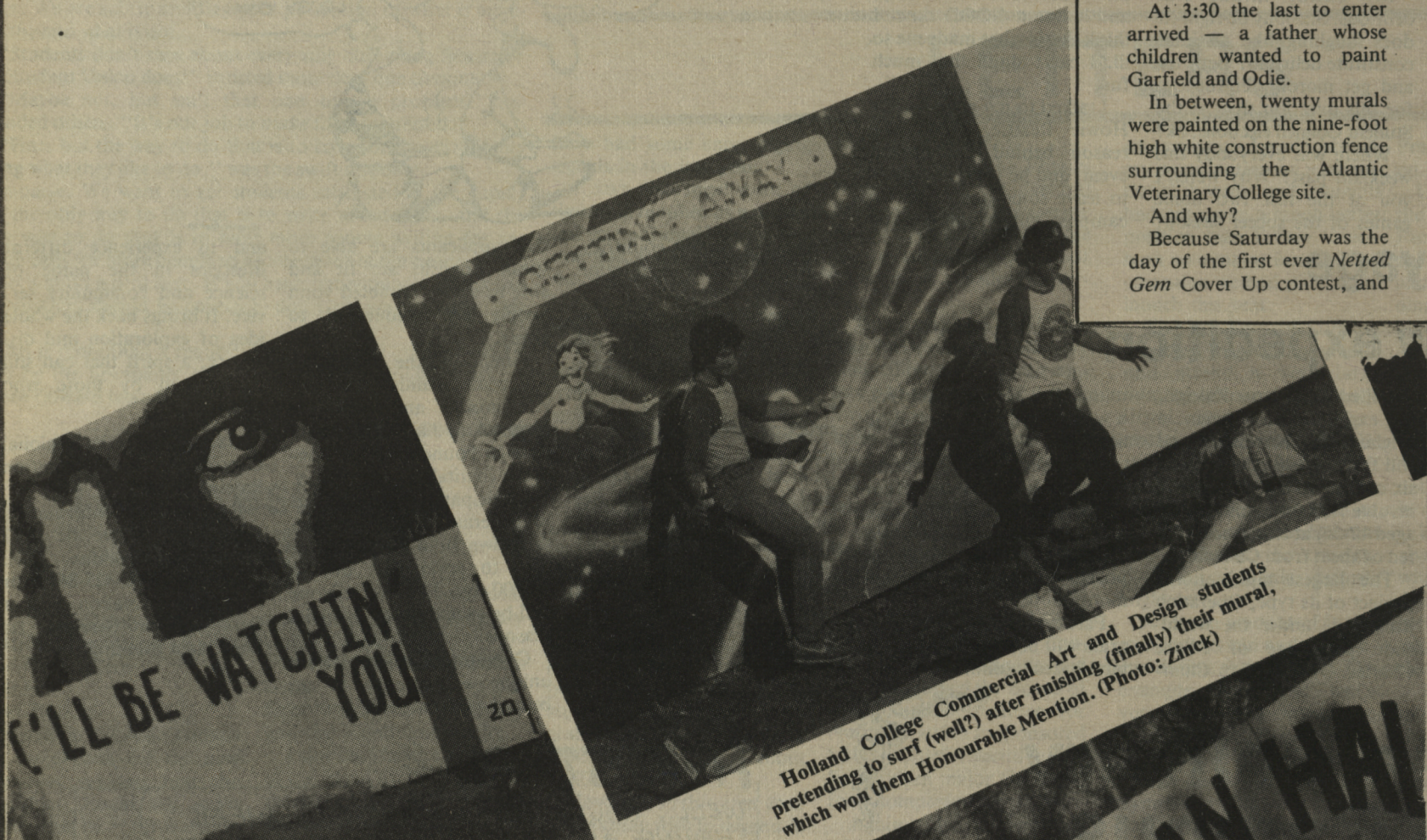
Holland College Commercial Art and Design students pretending to surf (well?) after finishing (finally) their mural, which won them Honourable Mention.

The UPEI Student Union was there, as anyone walking in back of Robertson Library can attest, along with Marian Hall, Bernardine Hall, the