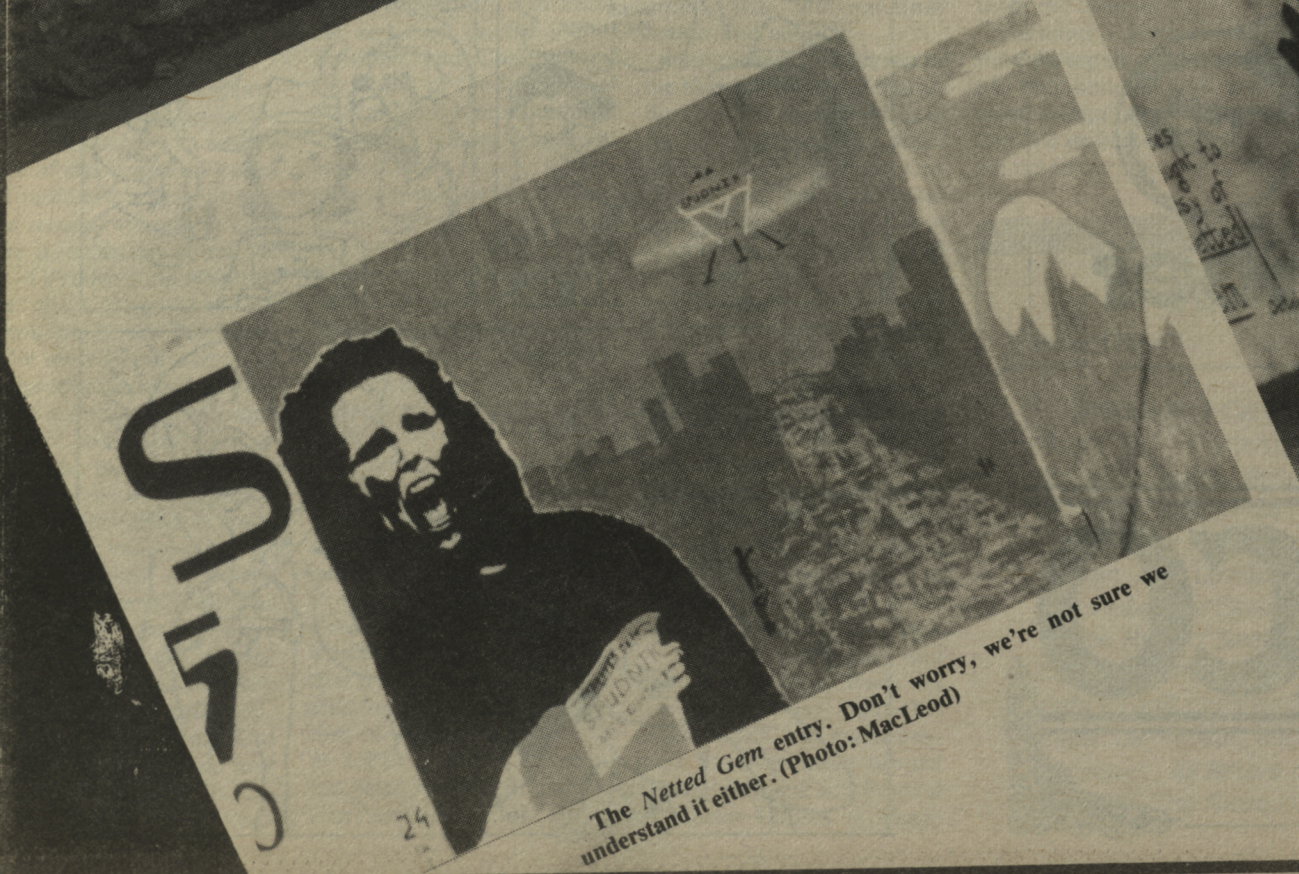
The Netted Gem entry. Don't worry, we're not sure we understand it either.