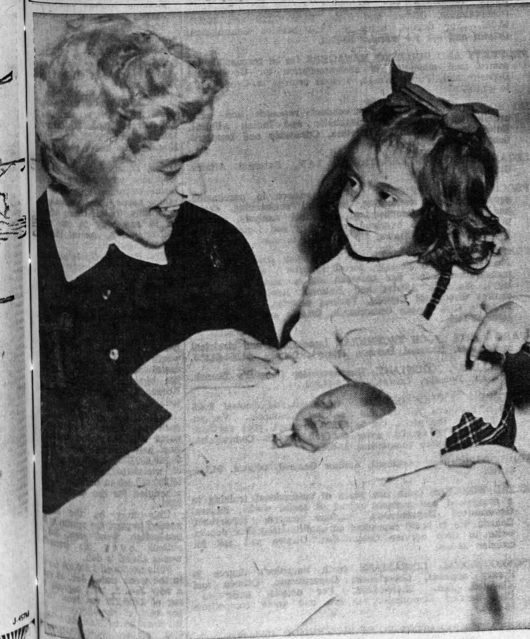
BORN IN AMERICA